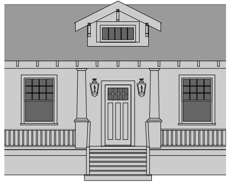
Elaborate light fixtures such as large brass gas lights are not appropriate for most of Cedartown's historic houses